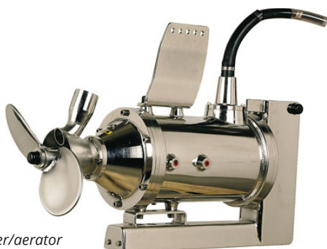
Landia PODBR-I submersible mixer/aerator